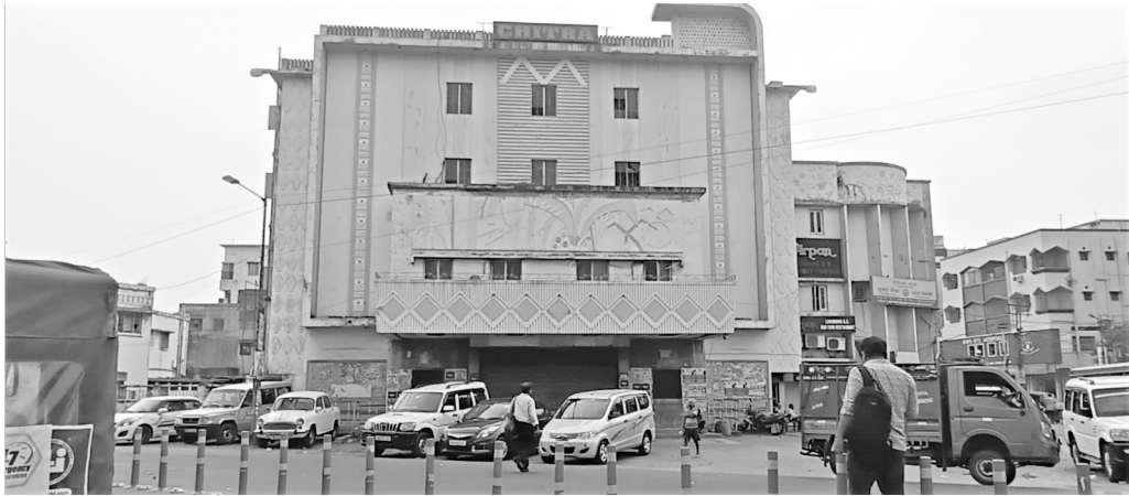
Chitra , a single screen theatre in Asansol, was shut down very recently i.e., in 2017

Disappearance of the single screen theatres has led to the extinction of adult film shows. It has isolated a huge section of patrons of not only adult films but also the audience of the regular “family” films. In particular, it has affected those belonging to the lower income groups, workers in both formal and informal sectors, their families and many others on the counts of “affordability” and lack of socio-cultural advancement or in the context of this article, lack of “urban” refinement that I will criticise and is a recurrent theme in this article.