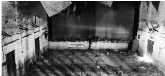
Inside Geetashree (the photo was taken on 25 th June, 2022)

The scenario was different in Baruiipur (a small town in the South 24 Parganas district) and Dakkhin Barasat (a village in the South 24 Parganas). Apparent harmonious co-existence between single screen theatres and video halls, as was noticed in the villages of East Midnapore, was denied by the hall owner of Milan