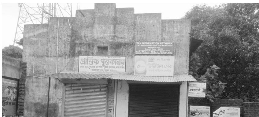
Maa Kamala Chitralaya , a closed down video hall in Kashipur, Purulia. It has been turned into a bookshop, an office of the tax consultant. A closer look at the image will allow us a glimpse at the illegible name of the erstwhile video hall The Curious Case of “Ladki Jawan Ho Gayi”

of Kashipur but also to a huge number of spectators from nearby regions, especially during weekly haats. The video hall was in a residential neighbourhood and showing adult films was no easy task. The owner, his son and his employee associated with the video hall in its heyday, outrightly denied exhibiting adult films in their video hall, although a couple of residents of the small town had other things to say. One of my contacts from Kashipur is a relation of the Rajbari (the royal place) and he claimed that the video hall in question did run a number of adult films but he and his family members refrained from going to such shows because of their reputation in the locality.